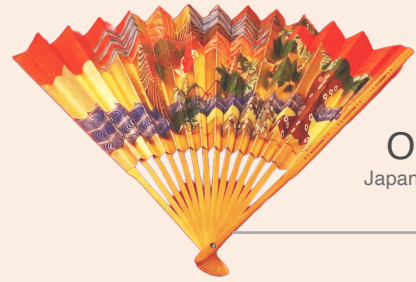
Ougi Japanese fan

The fee varies depending on the quality tier of the props.