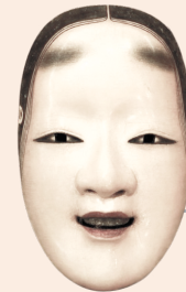
Noh mask Noh-men or Omote