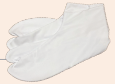
Tabi Japanese socks